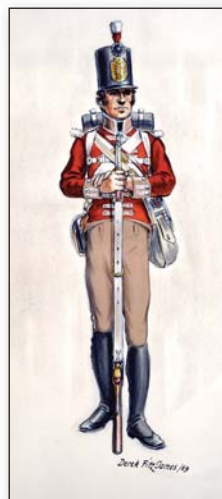
104th Regiment of Foot

During the War of 1812, the winter of 1813 was one of extreme cold and heavy snows. Between February and April, the 104th Regiment of Foot marched more than 1100 kilometres from Fredericton, New Brunswick to Kingston, Ontario to reinforce British troops and thwart an expected invasion by the Americans. This effort by a regiment of poorly clothed, frostbitten and hungry soldiers stands as an incredible feat in military history. Special geocaches have been hidden at more than 30 sites along the St John River and around the Province of New Brunswick to commemorate this feat. Geocache locations depict a spot where New Brunswick's 104th manned a fort, a blockhouse or outpost or an individual connected to NB 104th. When you discover a geocache, record the location, date, and code in this passport. The first 200 people who find and record at least 15 geocaches will receive a beautiful, commemorative, trackable Geocoin.